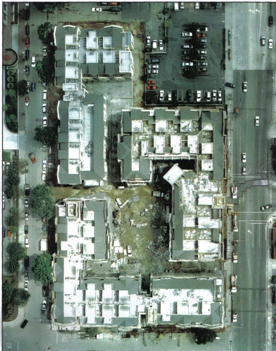
LEFT, AERIAL VIEW OF THE LUXURY APARTMENTS IN COSTA MESA, CALIFORNIA. BELOW, INSPECTION OF THE FINISHED ROOF ASSEMBLY.